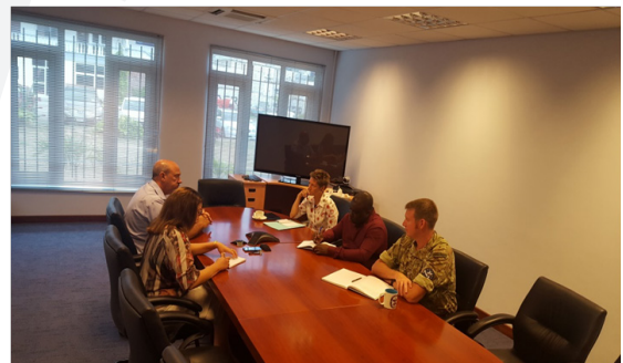
CGPCS Secretariat briefing British High Commissioner at REFLECS3, in Mahe, Seychelles

The meeting provided an opportunity for the Chair discuss with the High Commissioner ongoing progress within the contact group.